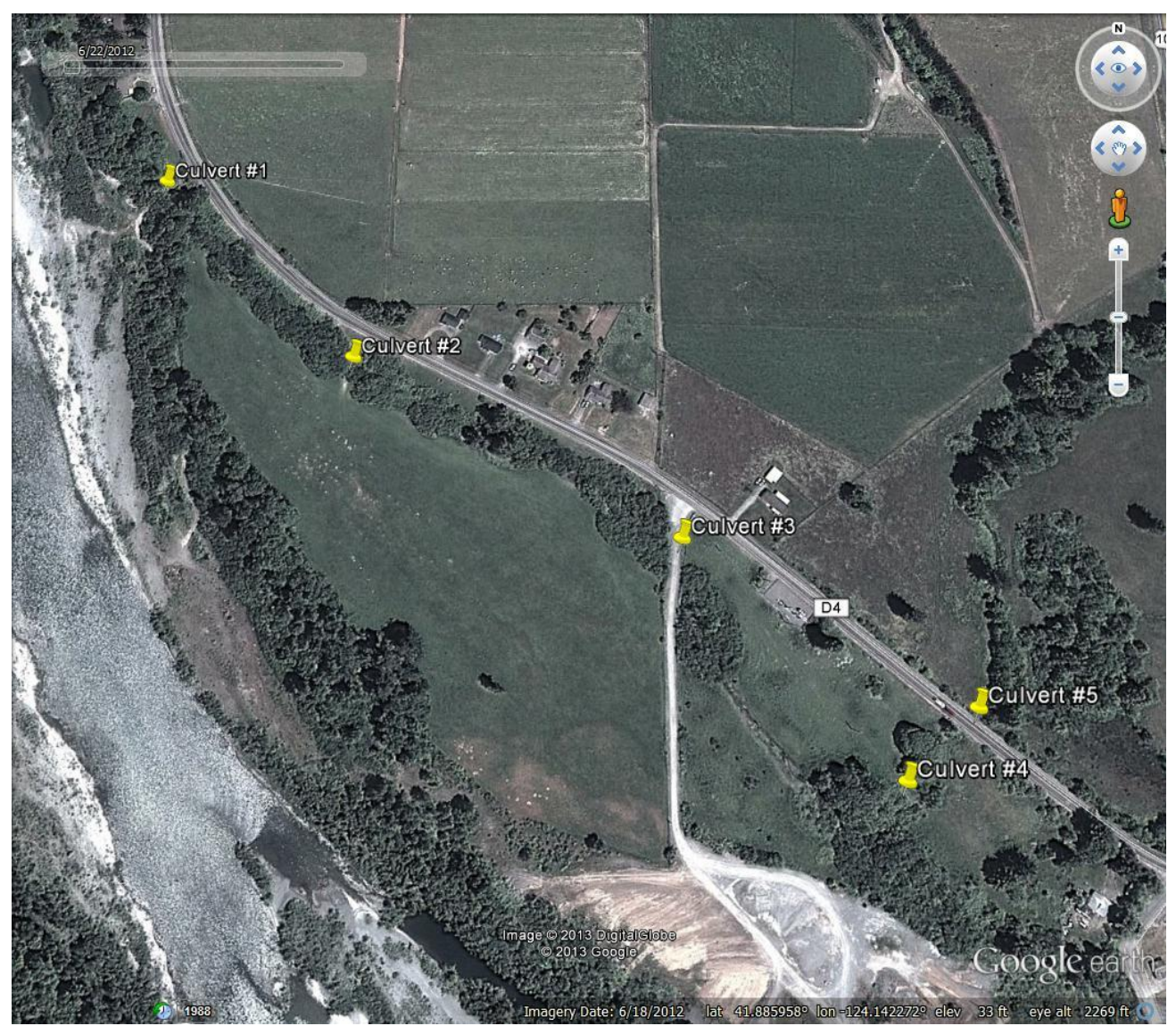
Figure 2. Approximate culvert locations on Unnamed Tributary to the Smith River.