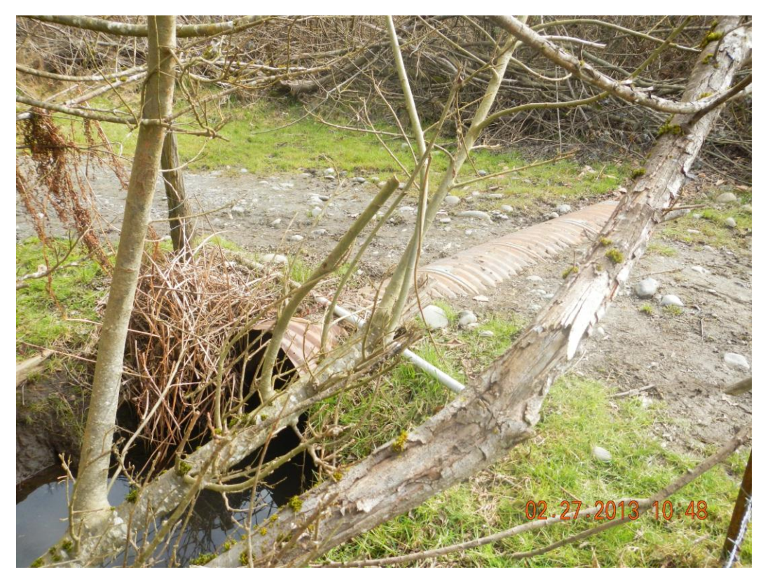
Figure 4. Livestock culvert crossing (Culvert #2). The culvert is undersized and the inlet was plugged with woody debris at the time of the survey.

Figure 3. Driveway stream crossing (Culvert #3) containing four separate culverts on the Unnamed Tributary to the Smith River. All three culverts are temporal upstream barriers to juvenile salmonids.