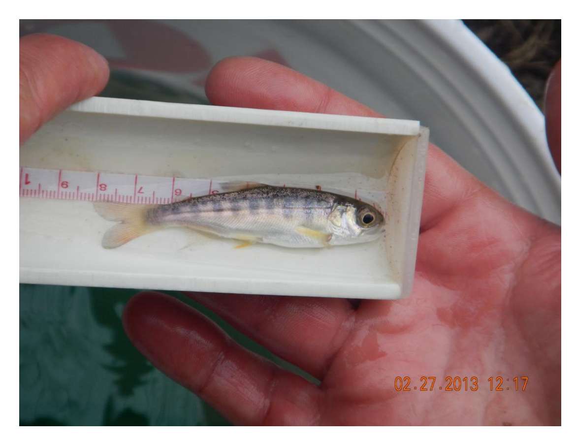
Figure 5. A juvenile coho salmon captured during February 27, 2013 survey effort.