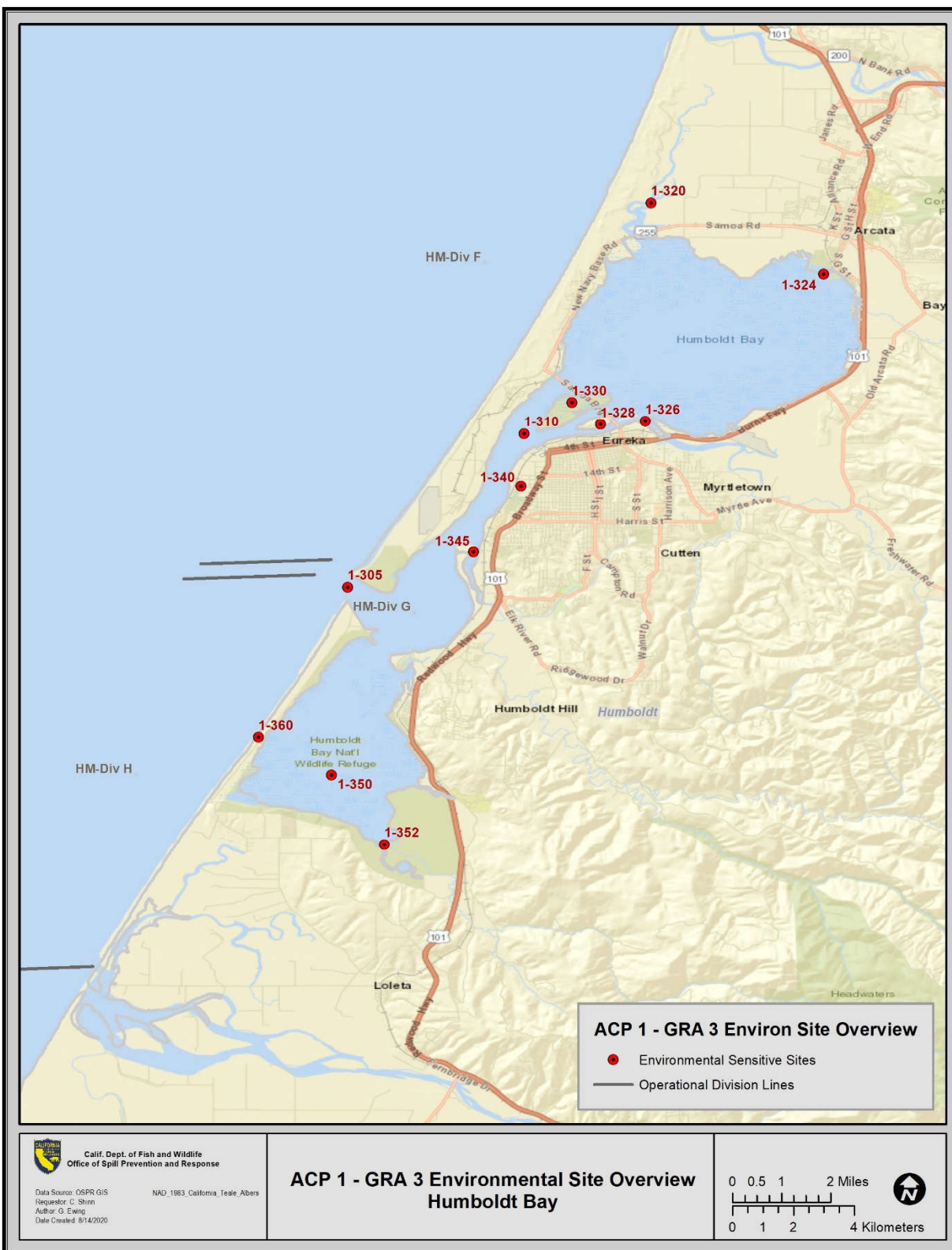
Figure 1: GRA 3 Environmental Sensitive Sites + Operational Divisions Overview