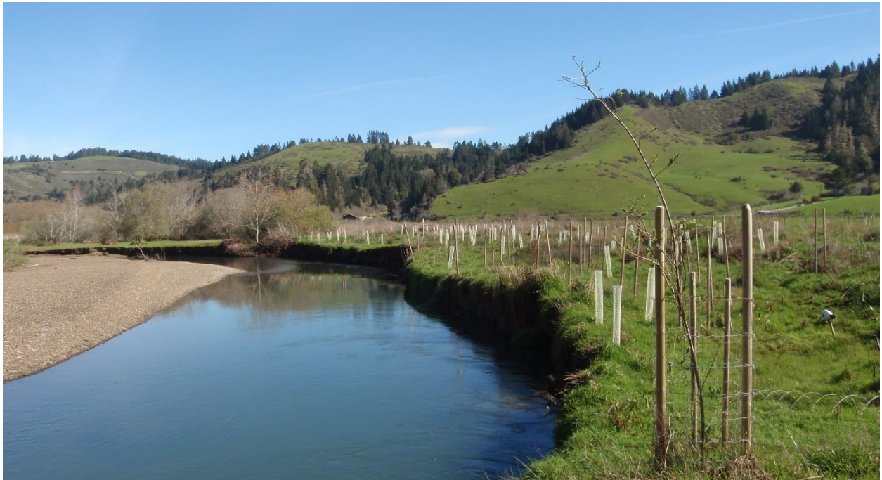
Ten Mile River

Open Solicitation: March 3, 2020 to May 1, 2020