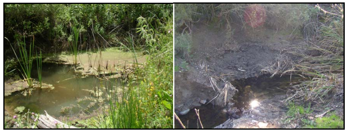
Figure 2. Lost Pond at San Luis Reservoir Wildlife Area prior to firebreak washout (at left) during May of 2005, and post washout (at right) during February of 2006.

This year we surveyed a total of 18 sites at UCCWA, including two newly located ponds. A grazing contract was in effect on this property between January and March of 2006. During past years cattle were sometimes placed on the property via one location and would congregate at select stock ponds. However, this year we observed that cattle were more effectively spread across the property, resulting in less disturbance of CRF habitat. We observed CRF at nine of our survey sites and were able to confirm breeding at