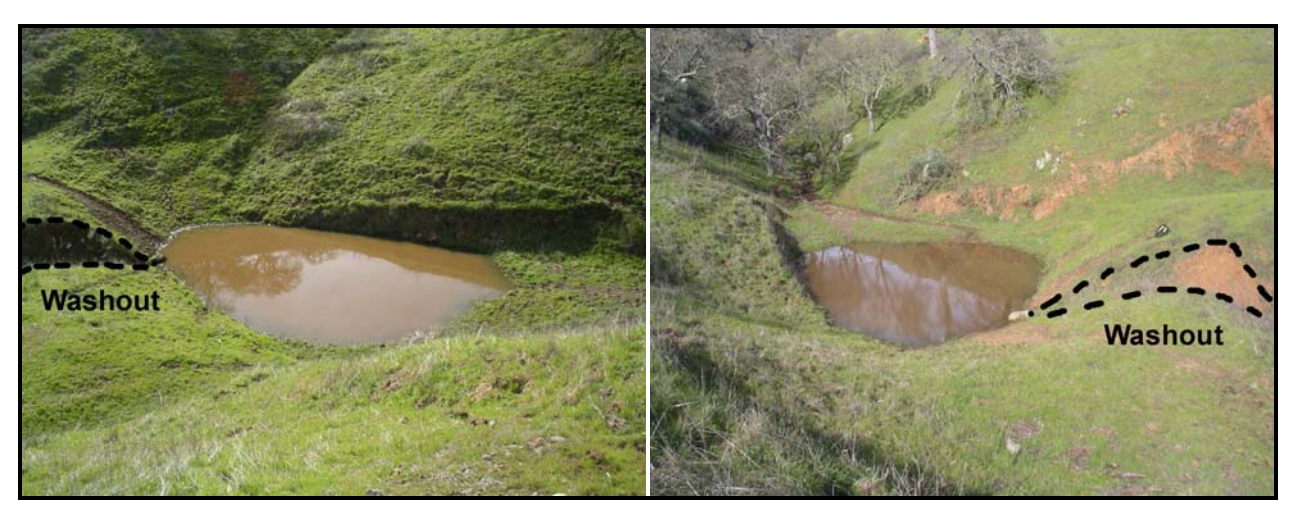
Figure 3. Upper Cottonwood Creek Wildlife Area berm erosion at Big Bully Gully while viewing pond from east side (at left) and from southwestern side (at right), 2006.

visit to the pond, we noticed a similar situation to that of Lost Pond at SLRWA, where the firebreak creating a berm at the lower end of the pond had washed out (Figure 3). However, the washout appears to have taken place years prior and this pond was completely dry by early May. In addition, no CRF were observed within the pond or along the drainage above. Because the drainage is spring-fed and often holds water even after the pond is dry, this site might be an excellent candidate for some type of restoration work as well. However, we feel no further surveying is necessary unless this pond is restored, and instead plan to focus our efforts on more optimal locations for the time being.