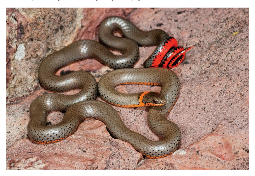
REGAL RING-NECKED SNAKE Diadophis punctatus regalis Baird and Girard 1853a