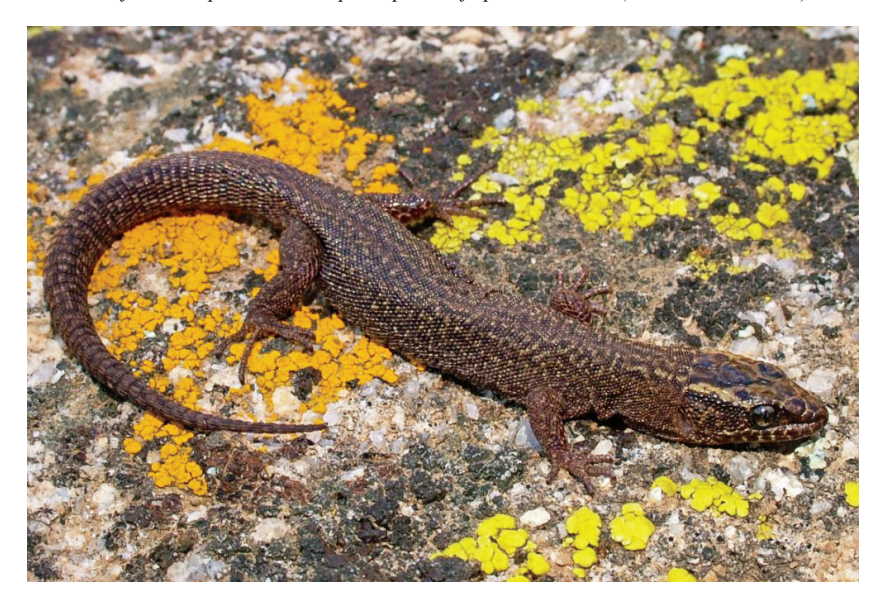
SIERRA NIGHT LIZARD