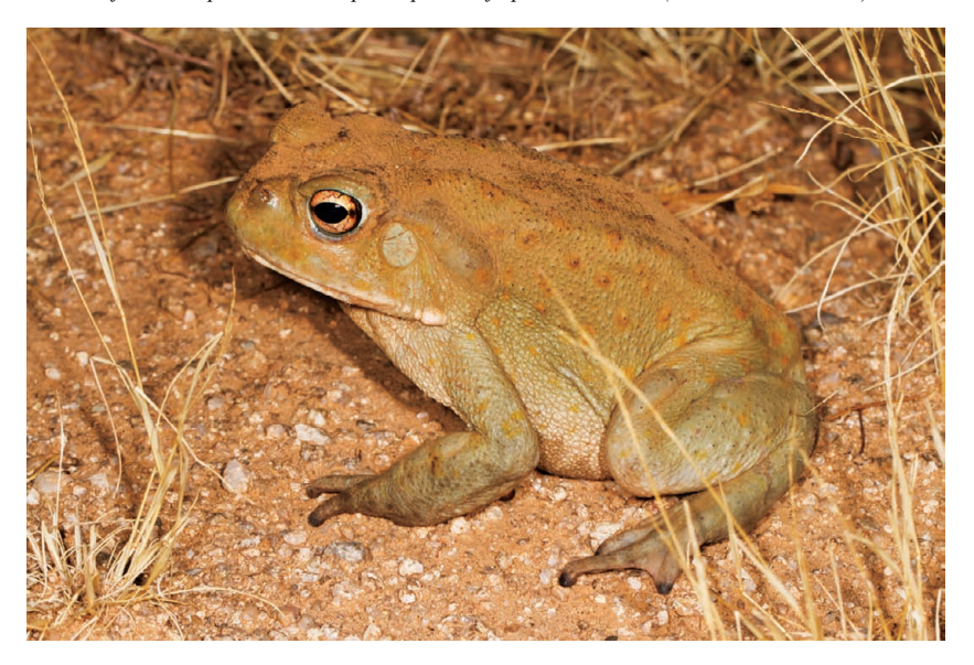
SONORAN DESERT TOAD