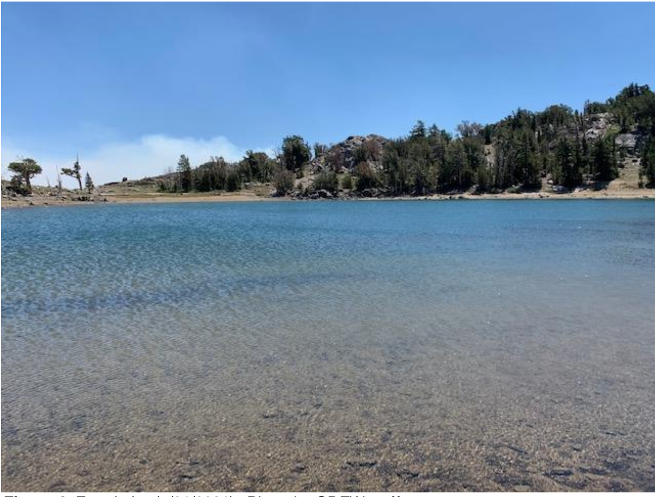
Figure 2. Frog Lake (7/21/2021).