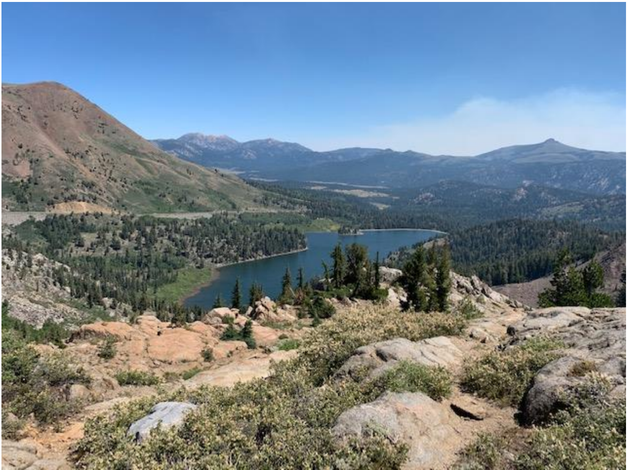
Figure 4 . Frog Lake outlet looking downstream into Red Lake (7/21/2021).

CDFW personnel conducted the Fellers and Freel (1995) Visual Encounter Survey (VES) Protocol as modified by CDFW to conduct the amphibian survey at Frog Lake. The VES began at 11:27 and ended at 11:38 on July 21 where the entire lake shoreline was surveyed. No amphibians were observed. In 2018, CDFW performed a VES in which no amphibians were observed (Ewing 2018). In 2014, CDFW performed a VES in which one Pacific Tree Frog ( Pseudacris regilla ) was observed (Ewing 2014). In 2001 during a High Mountain Lakes survey at the lake, no amphibians were observed (CDFW HML Database 2021). Based on the results of the evaluations completed, a pre-stocking evaluation will be written to keep Frog Lake to the CDFW fish stocking list.