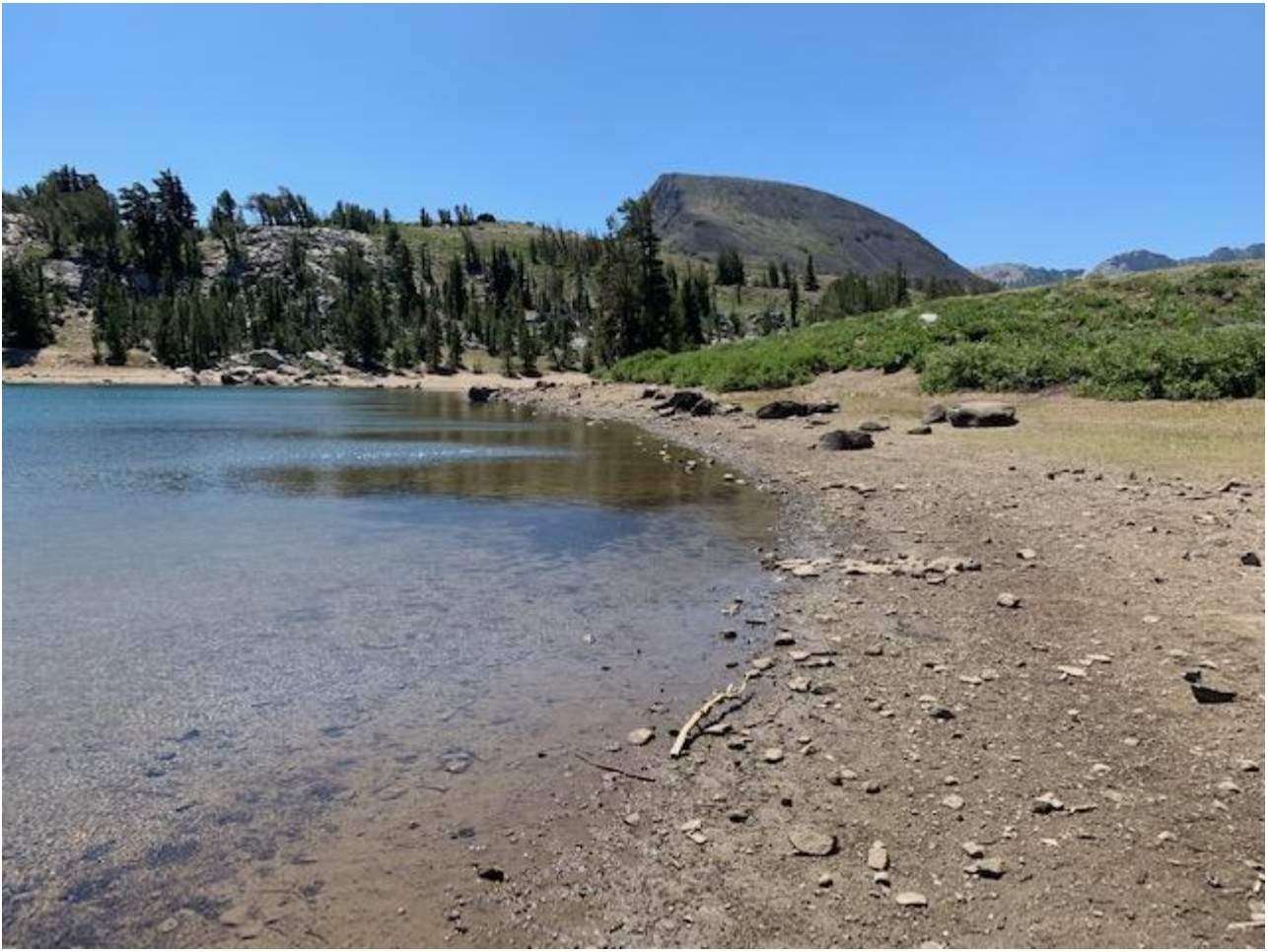
Figure 3. Frog Lake (7/21/2021).