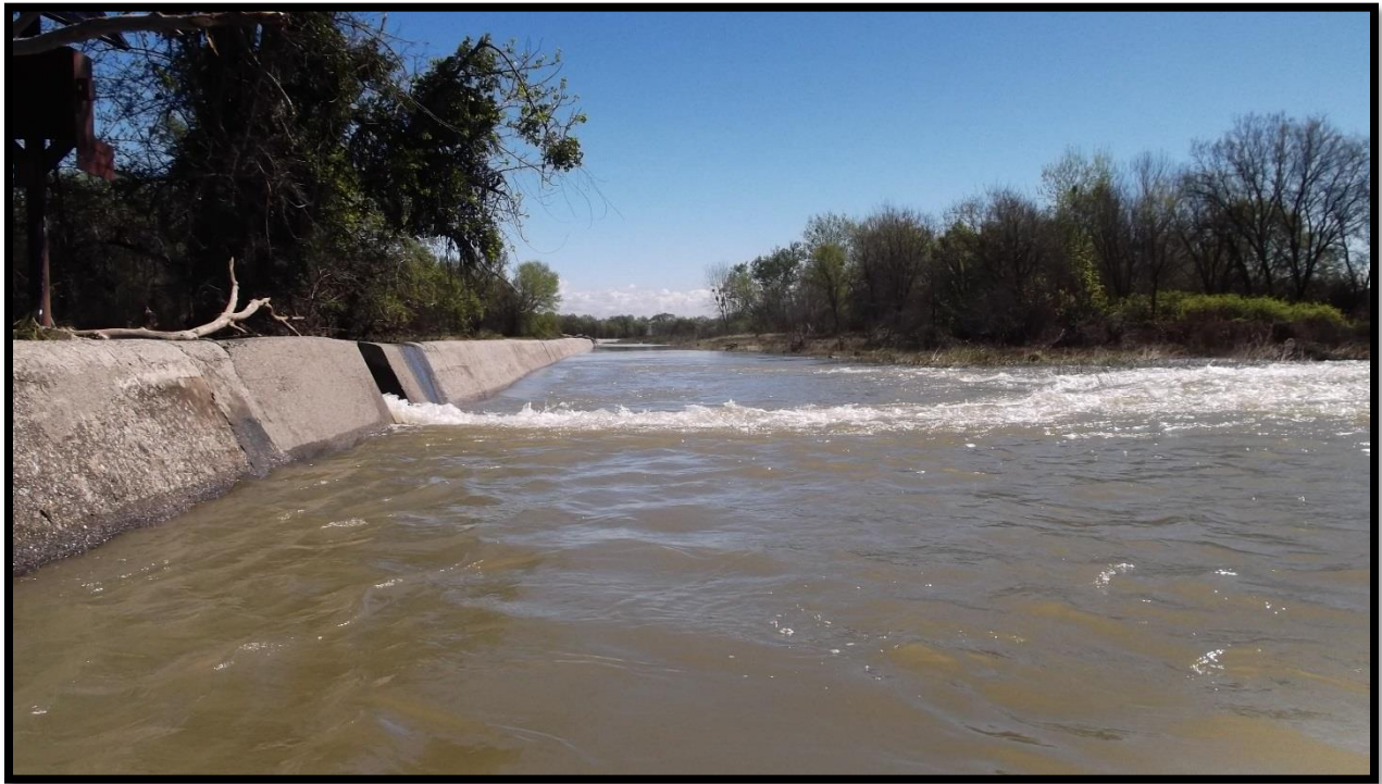
Figure 2. View of Fremont Weir during after cessation of overtopping event in March 2017. Flashboards have been removed to facilitate volitional fish passage to the Sacramento River prior to rescue operations