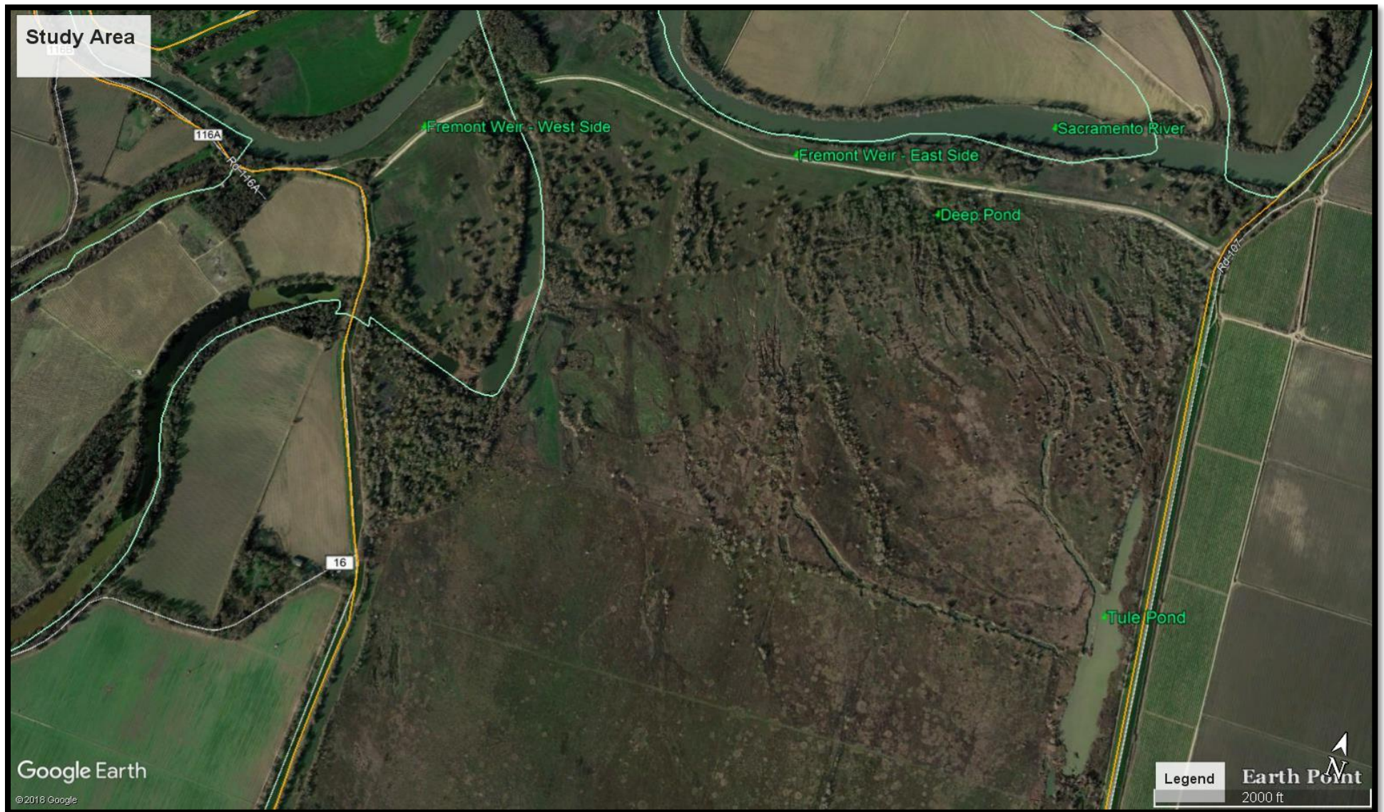
Figure 3. Fremont Weir and Northern Yolo Bypass (Fremont Weir Wildlife Area)