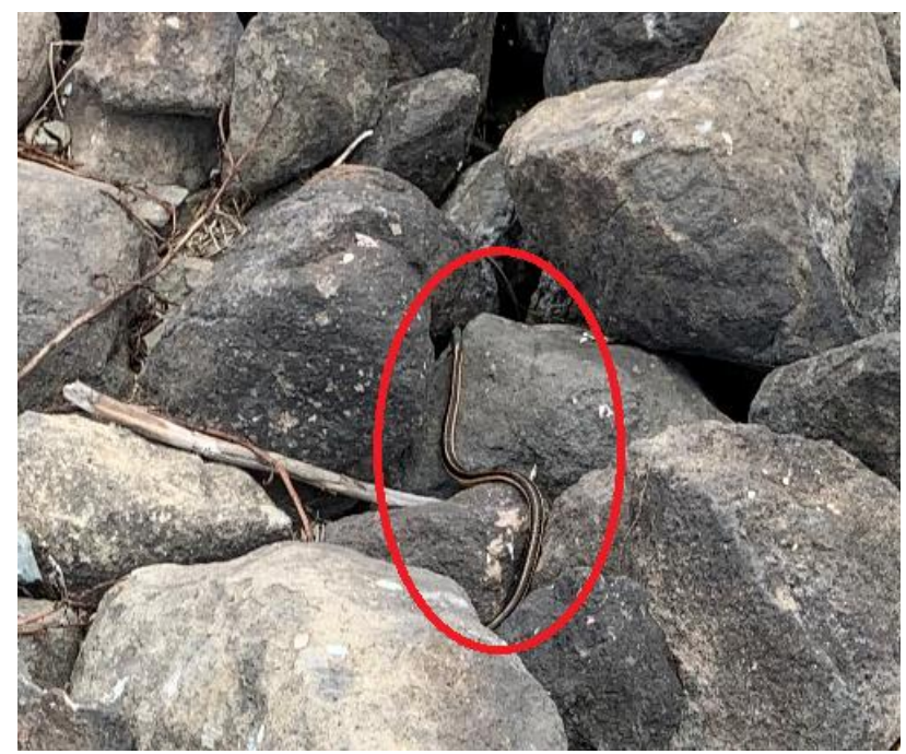
Figure 4 . Mountain Garter Snake observed at Heenan Lake on July 9, 2021.