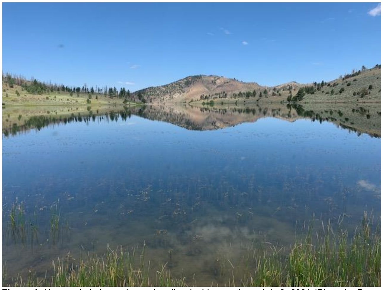
Figure 1 . Heenan Lake's southern shoreline looking north on July 9, 2021 (Photo by B. Ewing).