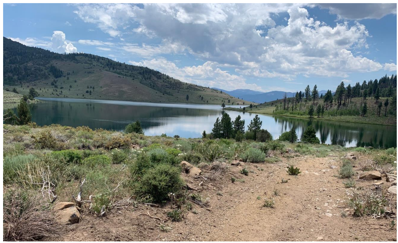
Figure 2. Heenan Lake's northern shoreline looking south on July 9, 2021.