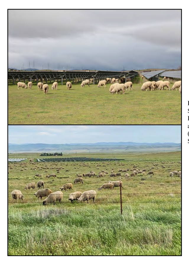
Figure 3. Sheep grazing at the Topaz Solar Farms (top) and California Valley Solar Ranch (bottom) in San Luis Obispo County, California.

In addition to permeable fencing and vegetation management, a number of other conservation measures beneficial to kit foxes and the other species also were implemented.