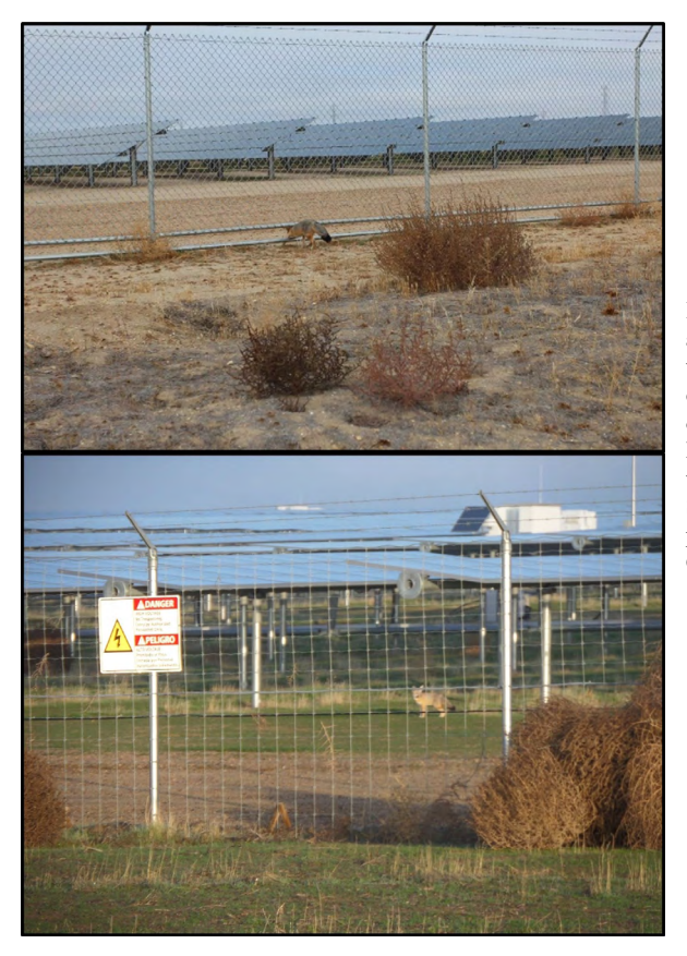
Figure 2. Images of security fences that are permeable to San Joaquin kit foxes at the Topaz Solar Farms (a kit fox is visible crossing through the gap at the bottom of the fence) and California Valley Solar Ranch (a kit fox that just crossed through the fence is visible inside the facility) in San Luis Obispo County, California.

At each of the facilities, the security fence surrounding the arrays of solar panels was designed to be permeable to kit foxes, as well as the smaller species of conservation concern and prey species. The fences are typically 2.4 m tall, sometimes with strands of barbed wire on the top. At most facilities, the fencing used was 5-cm mesh chain-link. To make it permeable to kit foxes, a gap of approximately 12–15 cm was left between the bottom of the fence and the ground (Fig. 2). Kit foxes can easily move through this gap. At the