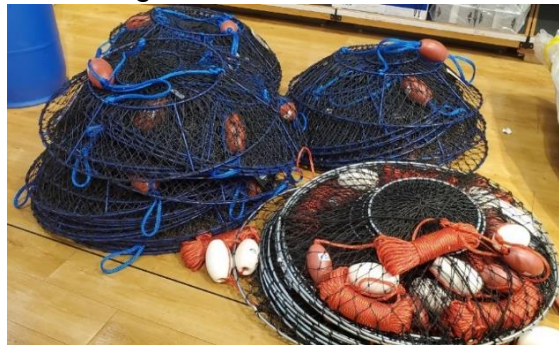
Figure 2 Examples of commercially available hoop nets. The net on the left (blue line) is an example of a Type B hoop net. The net on the right (red/orange line) is an example of a Type A hoop net.