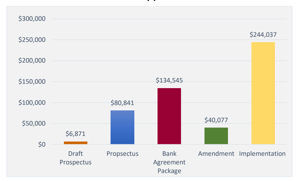
Chart 2. Fees collected for each bank application document in 2020