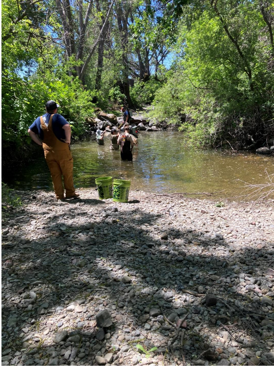
Figure 2. HCH-C rescue site on Adobe Creek by Big Valley Road on May 4, 2022