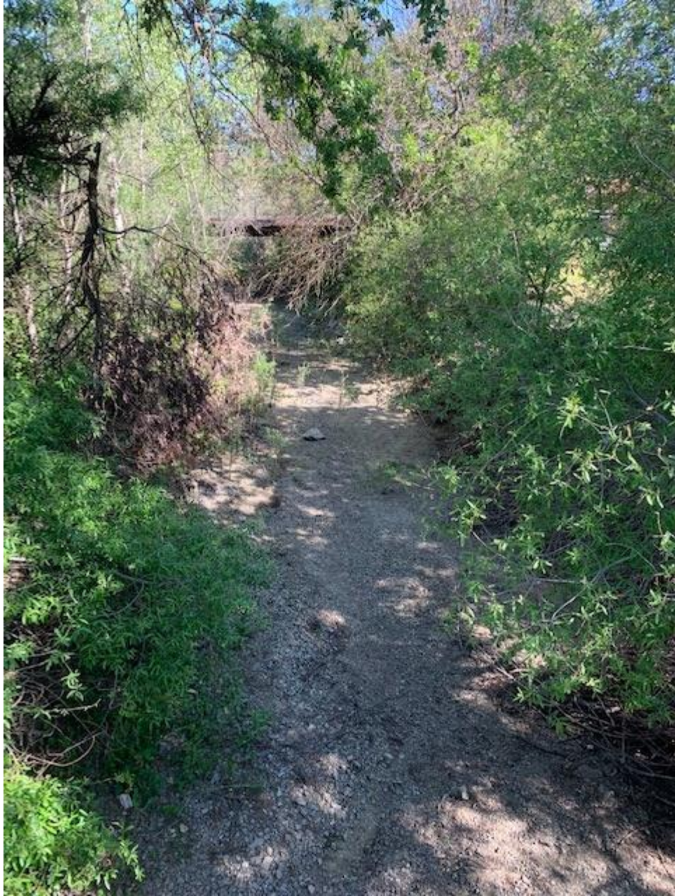
Figure 3. Adobe Creek (5/4/2022).