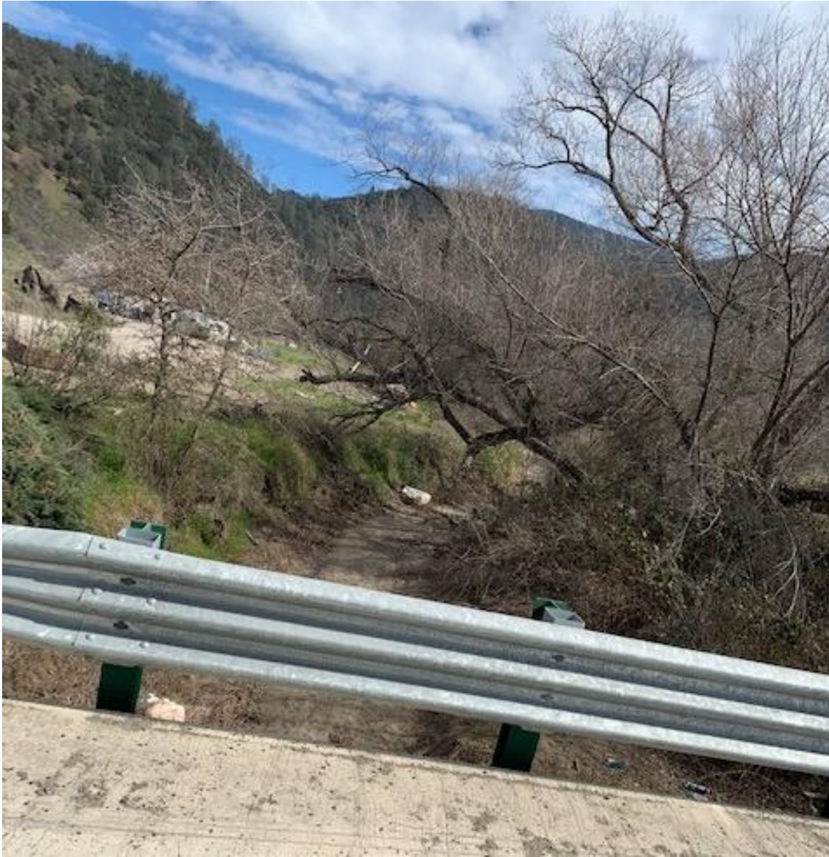
Figure 2. Cole Creek (2/18/2022).