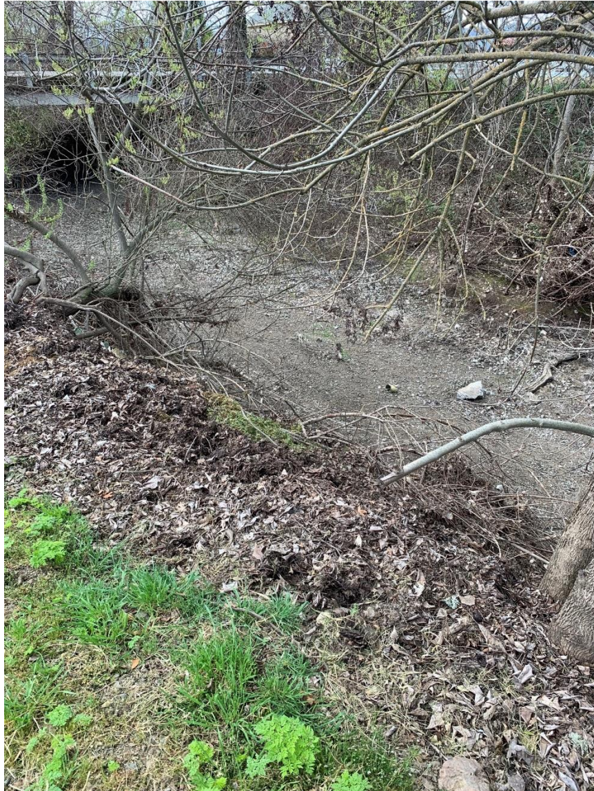
Adobe Creek (3/15/2022)