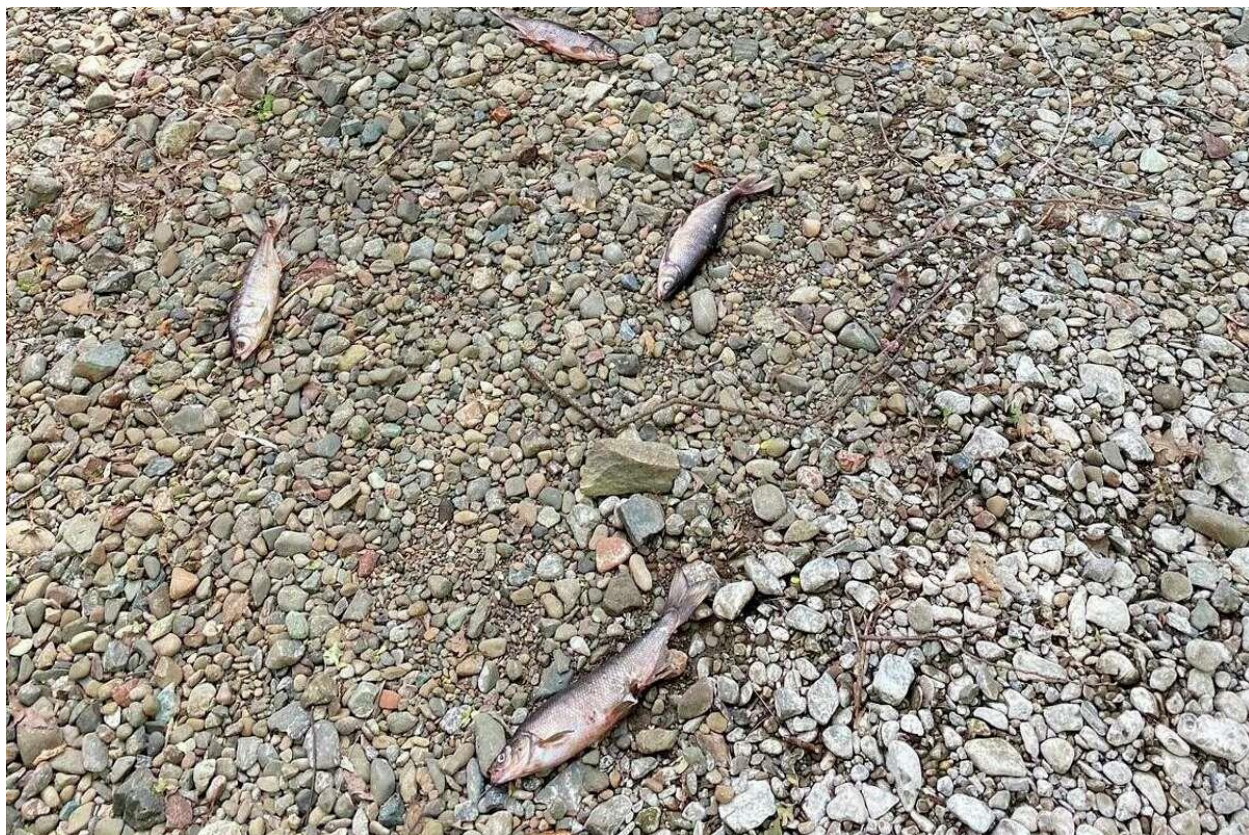
Figure 4. Adult HCH-C on Adobe Creek (April 2022).