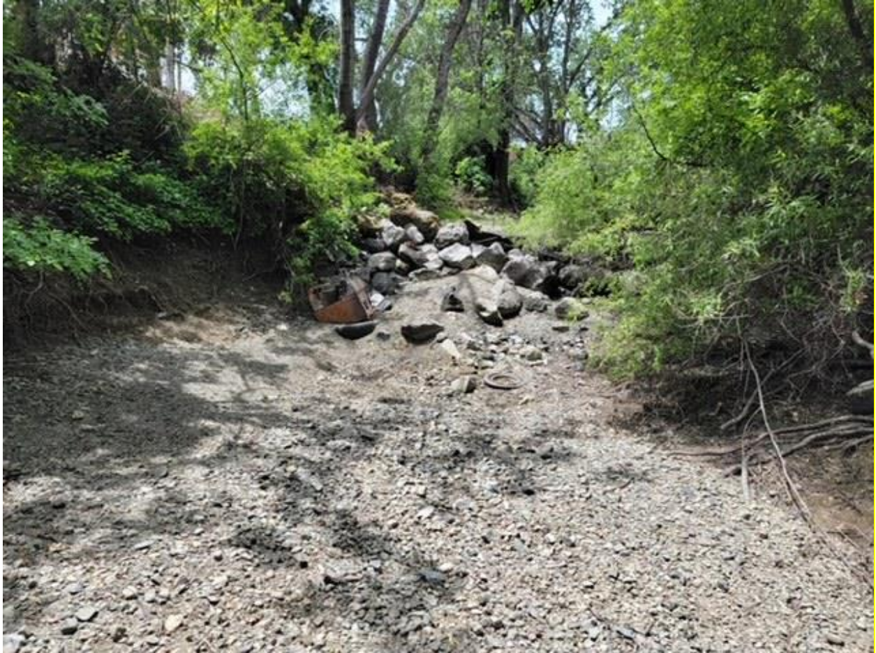
Figure 6. Same pool on Adobe Creek in Figure 5 on May 16, 2022.

Additionally, a survey conducted by the United States Geological Survey (USGS) in 2021 noted a large decrease in HCH-C observed in Clear Lake (F. Feyrer, Pers. Comm). The USGS collected 280, 290, and 76 HCH-C in 2017, 2018, and 2019 respectively, but only 40 HCH-C in 2021. It may be possible that there were few HCH-C in Clear Lake to begin their 2022 upstream migration into these tributaries. In the spring of 2022, CDFW was also conducting a population estimate of HCH-C in Clear Lake in which only 357 HCH-C were collected. Although the number of HCH-C seen in 2022 was the second lowest on record, it may have been due to fewer tributaries available for spawning. Instead of spawning in tributaries, HCH-C may have been spawning in Clear Lake; however lake spawning for is not ideal due to the susceptibility to egg predation by Common Carp ( Cyprinus carpio ) (Kimsey 1960).