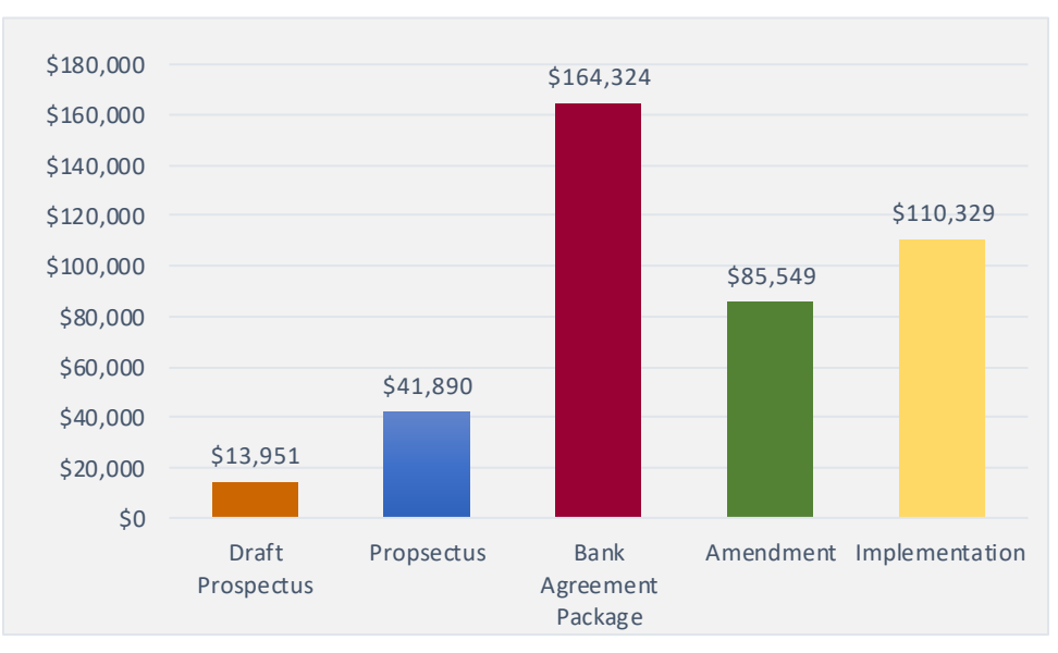
Chart 2. Fees collected for each bank application document or for implementation in 2021