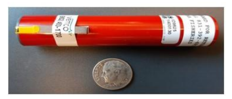
Red archival tags may be inside the body cavity – REWARD$ given for these tags.

If floy tagged fish are captured, please check for tags in the body cavity and contact project staff at: