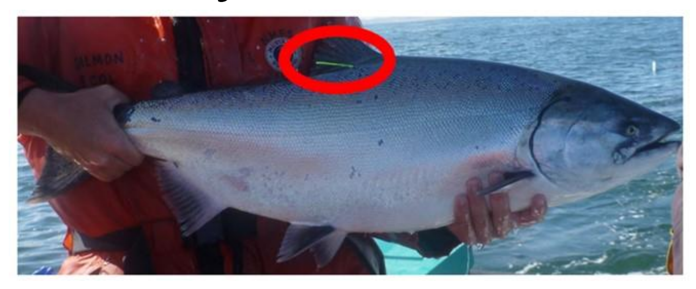
Please check CHINOOK for floy TAGS! Floy tagged fish may contain archival tags, possibility of REWARD for retrieval.