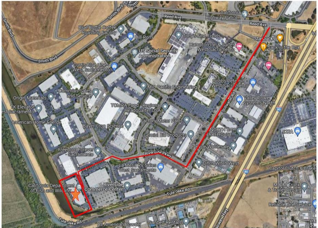
Figure 1: General Building Location of 1010 Riverside Parkway

The CDFW West Sacramento Facility is in the back southwest corner of the large industrial complex located off of Interstate 80. From Reed Avenue, turn left on to Stillwater Road. Turn right on to Riverside Parkway. Take the 2 nd left off Riverside Parkway to 1010 Riverside Parkway.