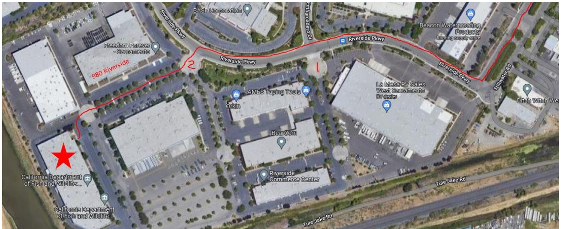
Figure 3: Closeup view of the location of the CDFW West Sacramento facility in the industrial business park.

Drive down main road and turn left into the parking lot next to the building. Overflow parking is available at 980 Riverside and along the street in front of the building.