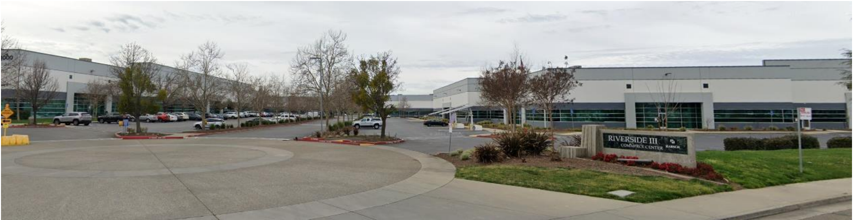
Figure 2: View of the frontage sign of the CDFW West Sacramento facility in the industrial business park.

Take the 2 nd left off Riverside Parkway. The frontage sign will read as “RIVERSIDE III COMMERCE CENTER”. The CDFW West Sacramento office is located at the end of this road on the left side of the road.