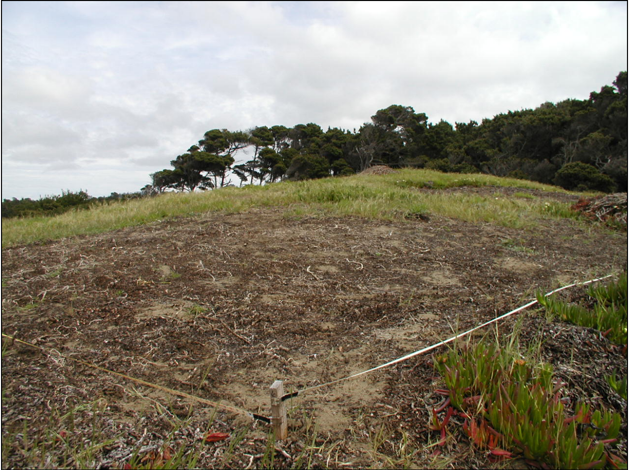
Photo 3. Spineflower Plot 6SW, May 2005.