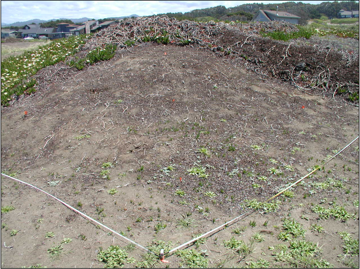
Photo 1. Spineflower Plot 14SW, May 2005.