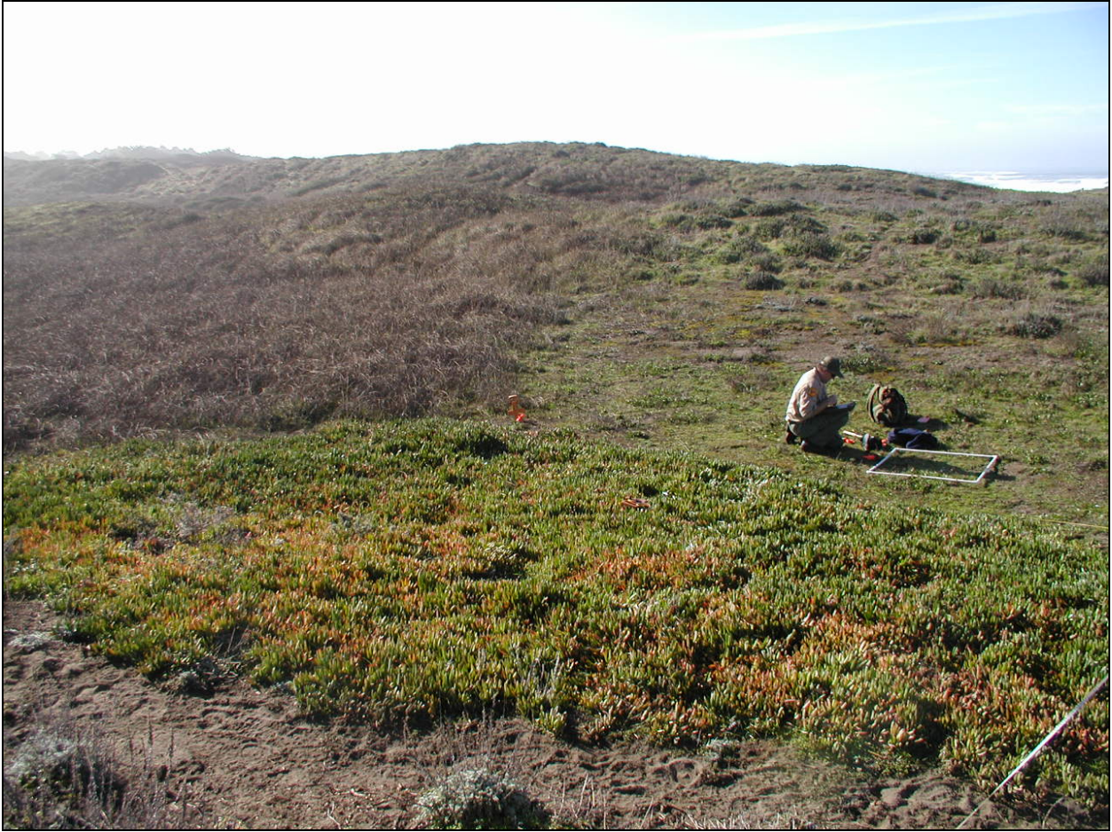
Photo 6. Spineflower Plot 24NW, January 2005.