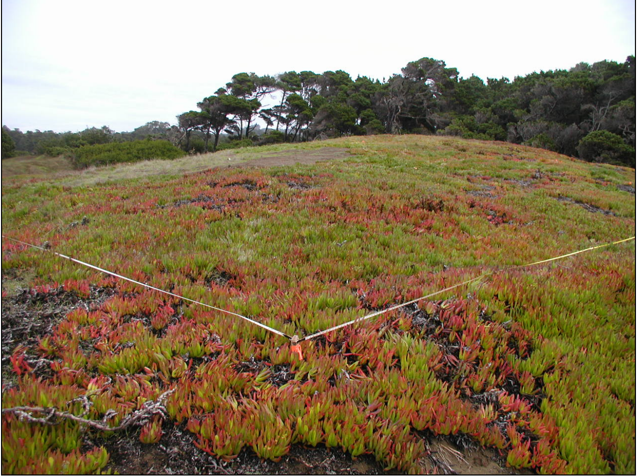
Photo 4. Spineflower Plot 6SW, January 2005.