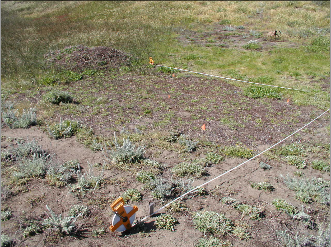
Photo 2. Spineflower Plot 14SW, May 2005.