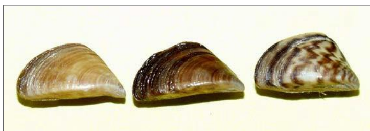
Color variation in quagga and zebra mussels

Quagga and zebra mussels are freshwater mussels that can physically attach onto hard substrates. Like the mussels found clinging to the rocks along the California coastline, quagga and zebra mussels attach onto hard surfaces (e.g. pipes, screens, rock, logs, boats, etc.). They form colonies made up of many individuals attached onto an object and even onto each other. Small newly settled mussels feel like gritty sandpaper when attached to a smooth surface. Larger mussels will feel coarser (like a small pebble or sunflower seed) or be visually apparent.