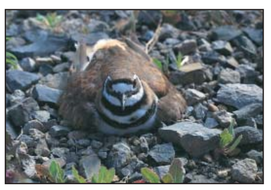
A killdeer on a nest on the edge of a service road in the Huichica Creek Unit.

hydrologists from the University of California at Davis and staff from the Napa and Southern Sonoma County Resource Conservation districts. The basic task of this group is to better understand the hydrology, water quality and ecology of the salt ponds to improve future restoration projects in the marsh.