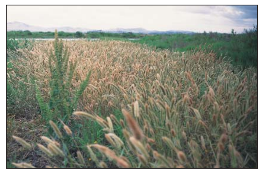
Rabbit's-foot grass established on a berm in the center of pond 2A less than two years after the original breach.

Encouraged by the results at pond 2A, the Napa-Sonoma Marshes Restoration Group was established in 1996 with the assistance of the California Coastal Conservancy. Members of this board-based group include representatives from the DFG, Environmental Protection Agency, United States Fish and Wildlife Service, United States Geologic Survey, San Francisco Estuary Institute,