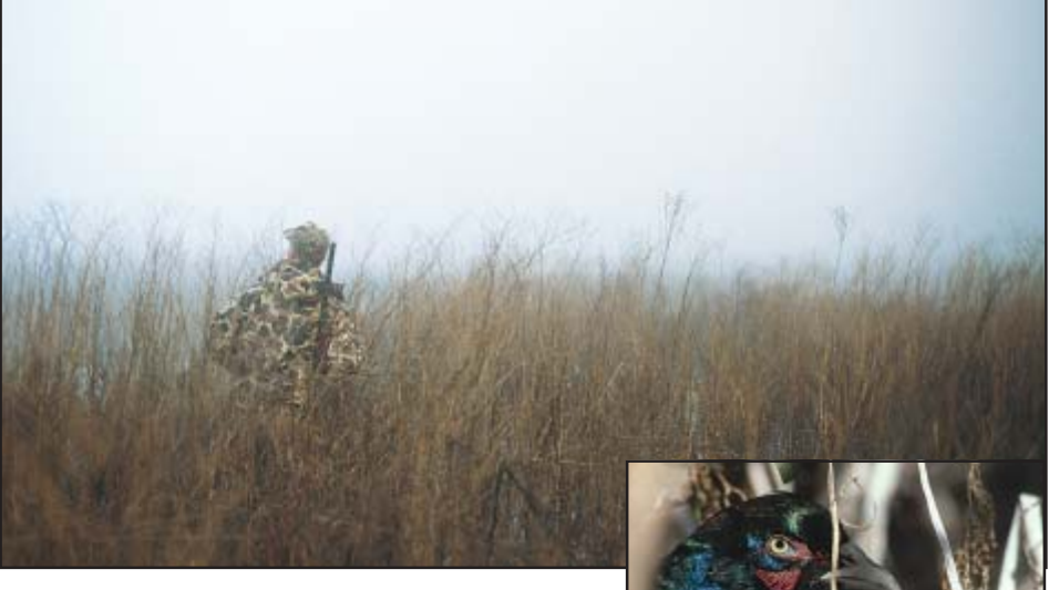
Above, a waterfowl hunter scans a seasonal pond for a place to set decoys.

wetlands to brackish and tidal salt marsh to intertidal mudflat and ultimately to open water. Each habitat is distinct. The native perennial bunchgrasses of the uplands provide habitat for the western meadowlark and savannah sparrow, nesting cover for the mallard and gadwall as well as a foraging area for northern harriers and black-shouldered kites. At a much lower elevation, the intertidal mudflats provide migratory staging areas for wintering shorebirds such as western sandpipers and dowitchers. They feed on a rich fauna including isopods, insects, bivalves and polychaete worms. When higher tide conditions cause these feeding grounds to become inundated, other shorebirds such as willets and godwits are often found in the pickleweed, salt grass, rushes and sedges that grow in areas of high marsh or accreted berms. These areas are also preferred refuge for the endangered salt marsh harvest mouse and California clapper rail.