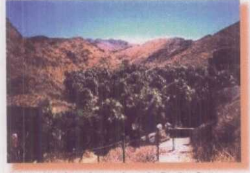
Overlooking Palm Conyon from the Trading Post

deeded in trust, to the Agua Caliente people, 32,000 acres to be used as their homeland. At the same time they gave to the So. California Railroad, on either side of the railroad, ten miles of the odd sections of land to induce them to build the railroad. Of the reservation's 32,000 acres, some 6,700 lie within the Palm Springs city limits. The remaining even sections fan out across the desert and mountains in a checkerboard pattern.